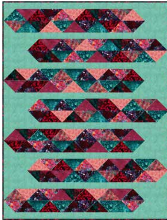
Helix (H): 51" x 67"