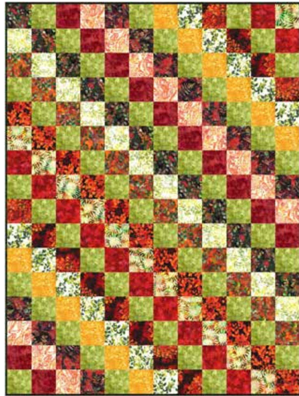
Cidermill (C): 54" x 72"