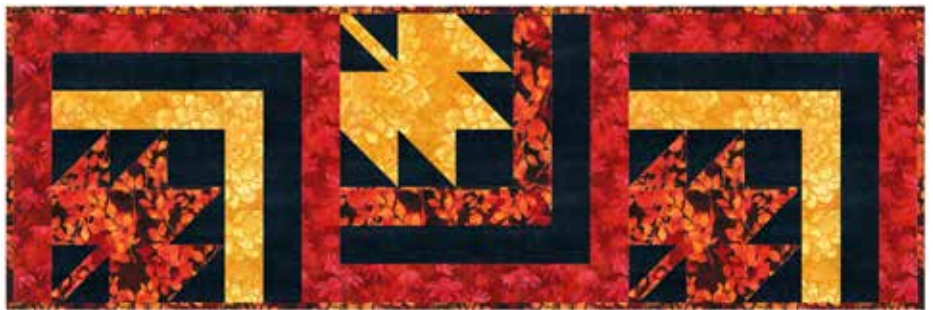
Maple Grove (MG): 15" x 47"