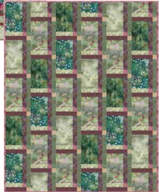
Running Bond by Tourmaline & Thyme Quilts