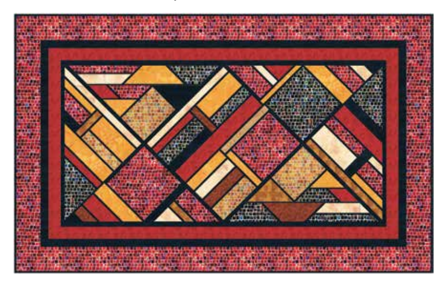
Red Velvet (RV) Colorway