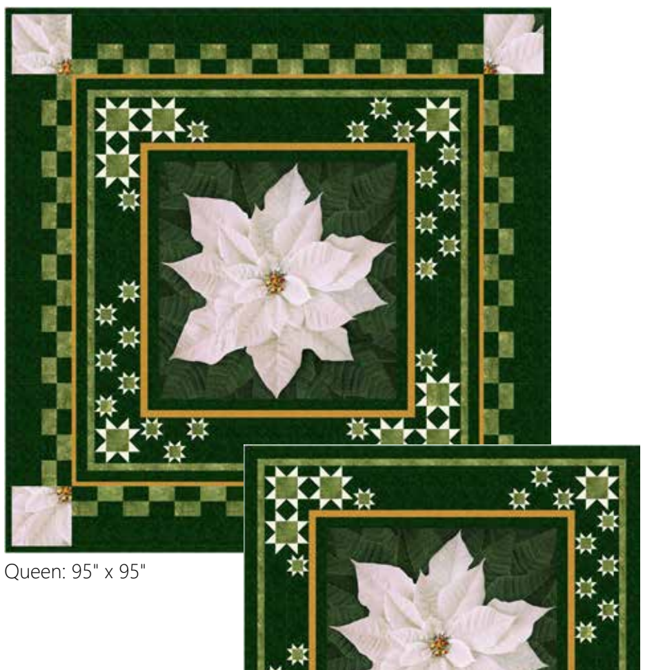
Throw: 71" x 71"