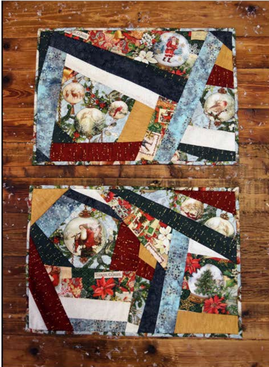
Finished size 13" x 19"