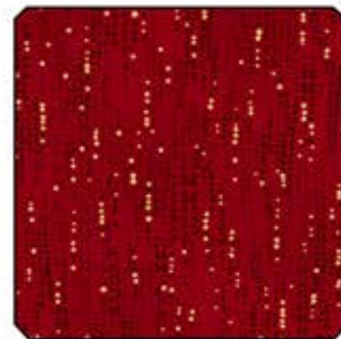
N7541 38G-Burgundy Gold