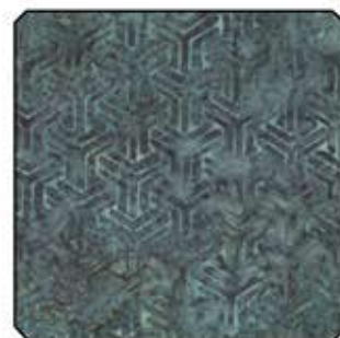
N2890 313-Payne's Grey