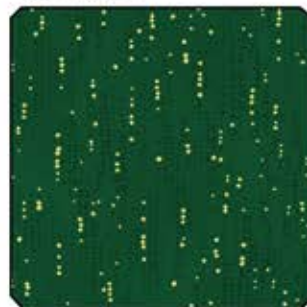
N7541 60G-Hunter Gold