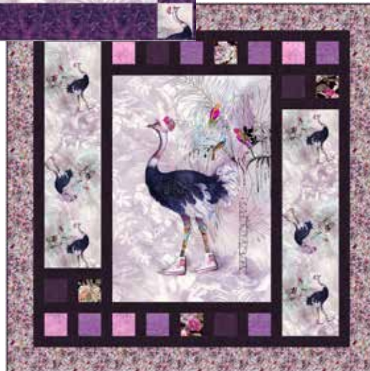
Triptych: 65" x 65"