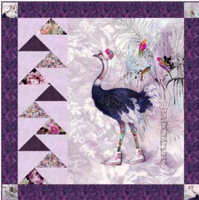
Flight Up: 48" x 48"

Funky and fresh, these quilts bring out the good vibes in any space.