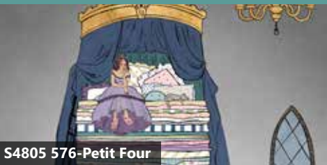
S4805 576-Petit Four