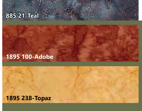
PURCHASE PATTERN QuiltingRenditions.com