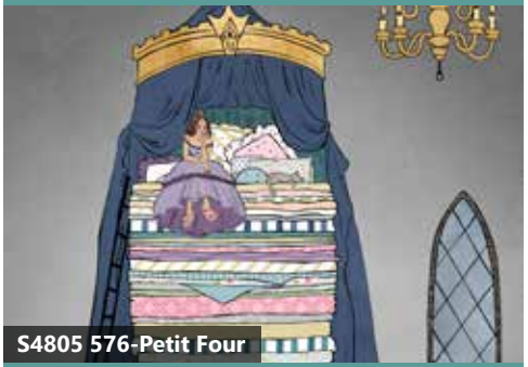
S4805 576-Petit Four