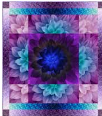
70" x 70"