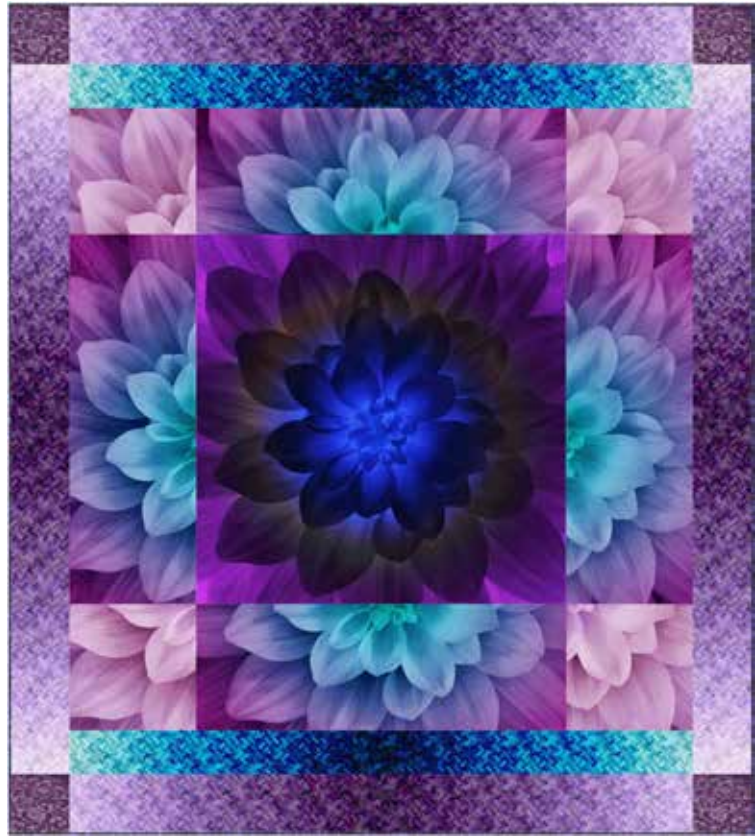
64" x 64"