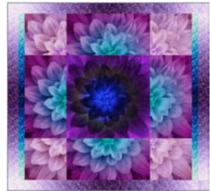
80" x 80"