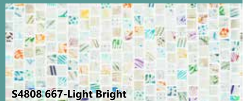
S4808 667-Light Bright