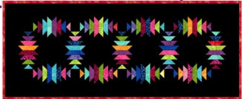
Starlight Table Runner: 20" x 50"