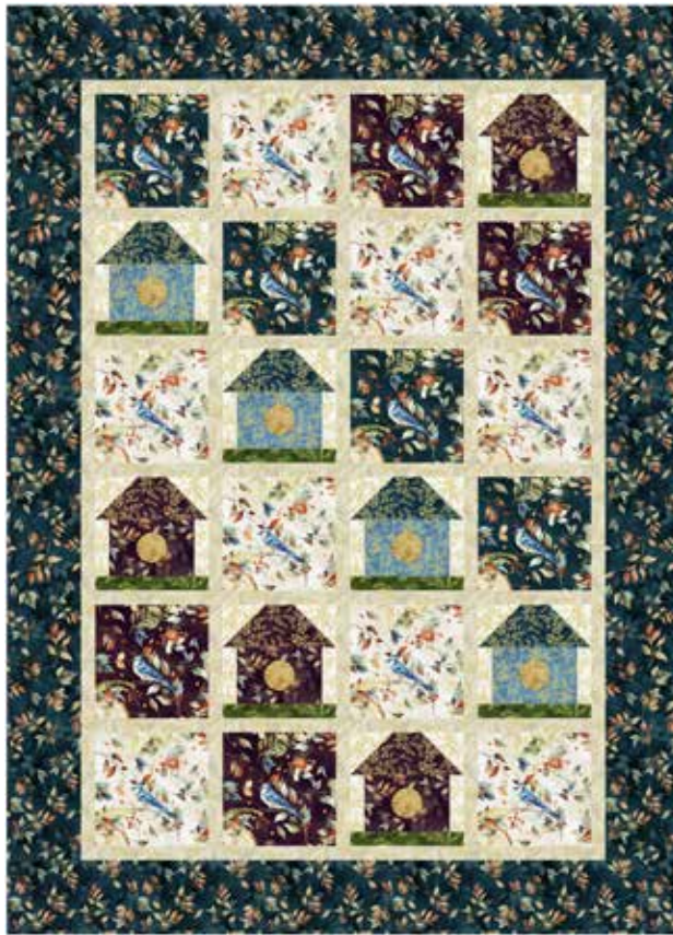
Twittering Blue Jays (TBJ): 47" x 65"