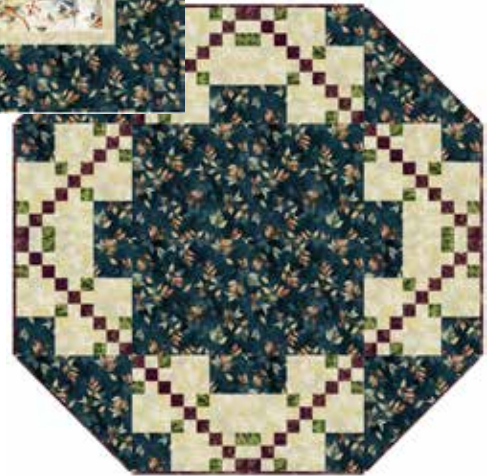
Blackjack (BJ): 36" x 36"