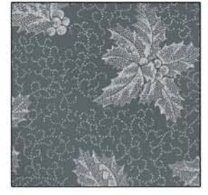
N7527 55S-Charcoal Silver