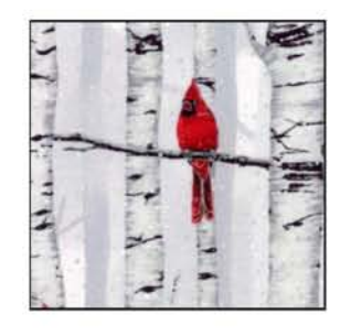
L7325 483S-Fog Silver