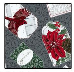
N7522 55S-Charcoal Silver