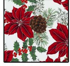
N7525 113S-Frost Silver