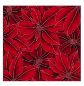
N7524 5S-Red Silver