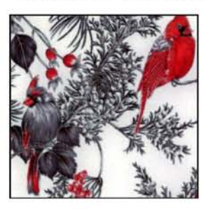
H8821 483S-Fog Silver