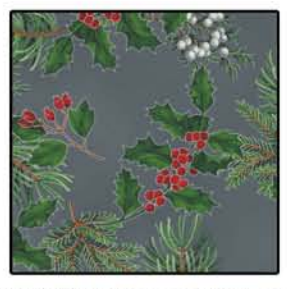
N7526 55S-Charcoal Silver