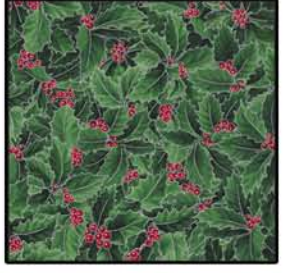
N7527 113S-Frost Silver N7529 55S-Charcoal Silver

View swatches and download quilt patterns at hoffmanfabrics.com.