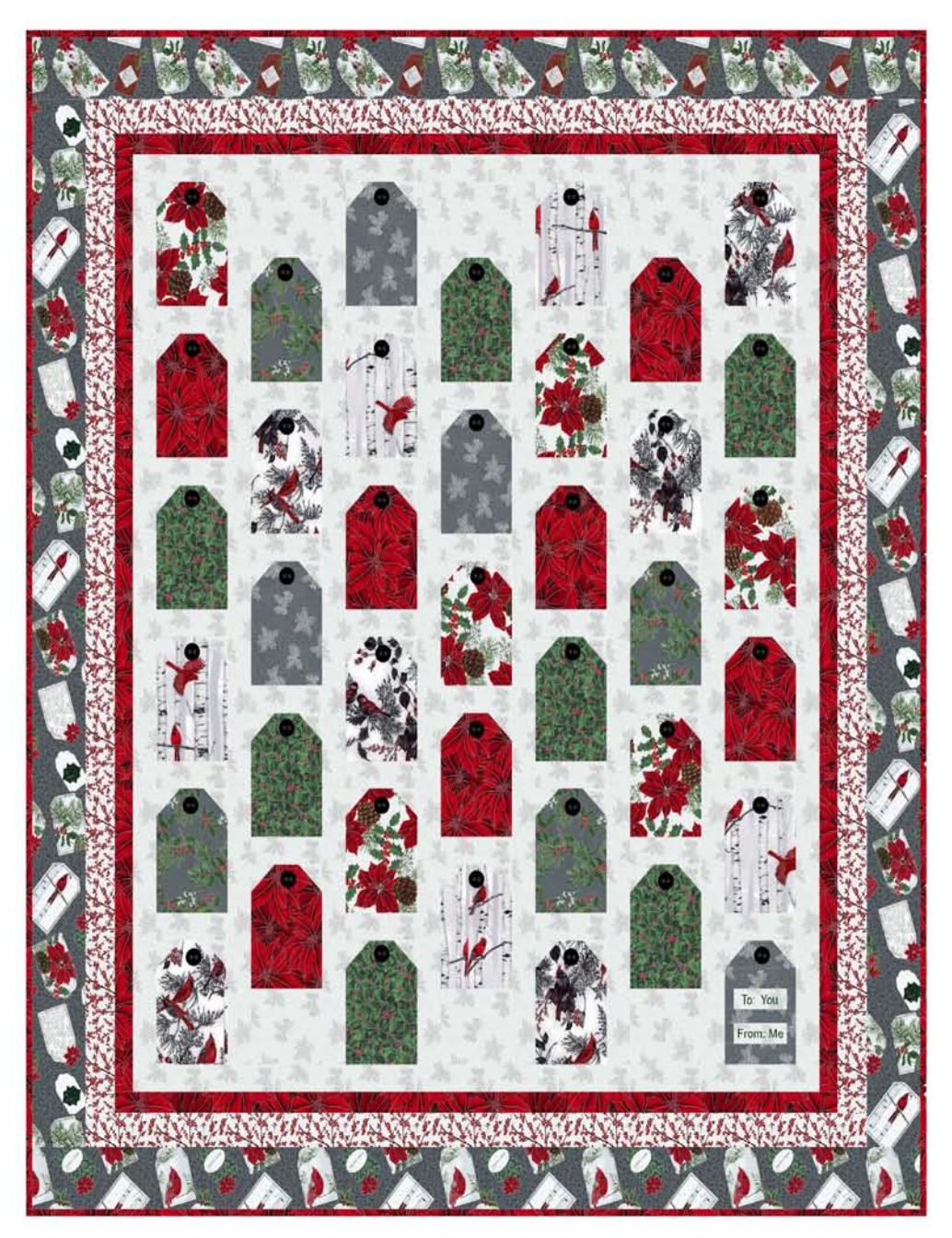
Finished quilt size: 75" x 85"