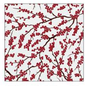
N7523 113S-Frost Silver