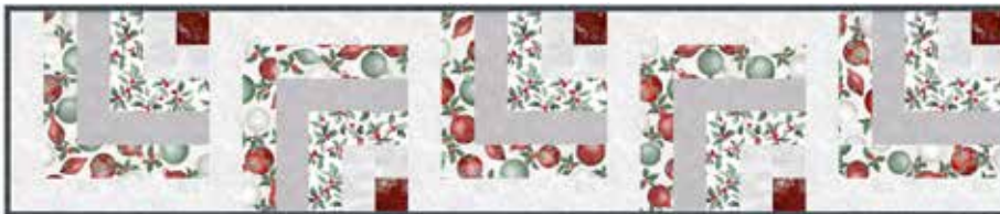
After the Rain (ATR): 12" x 60"