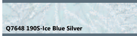
Q7648 190S-Ice Blue Silver