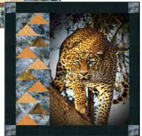
Flight Up: 48" x 48"