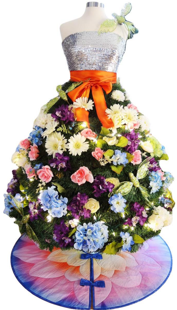
Festive for your special event!!!