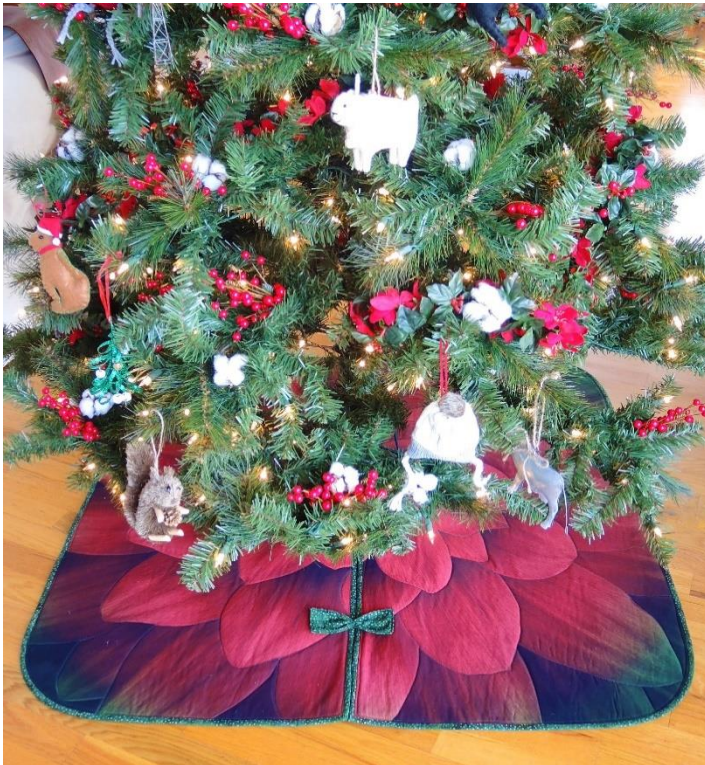
Traditional Colors non-traditional shape!