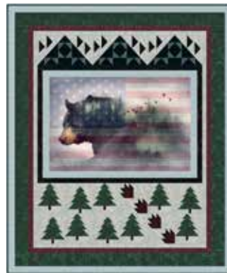
Throw: 67" x 80"