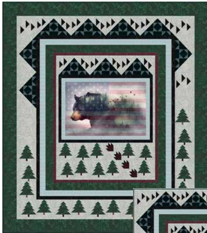
King: 170" x 120"

Celebrate your American pride and love for the outdoors in one cozy quilt!!