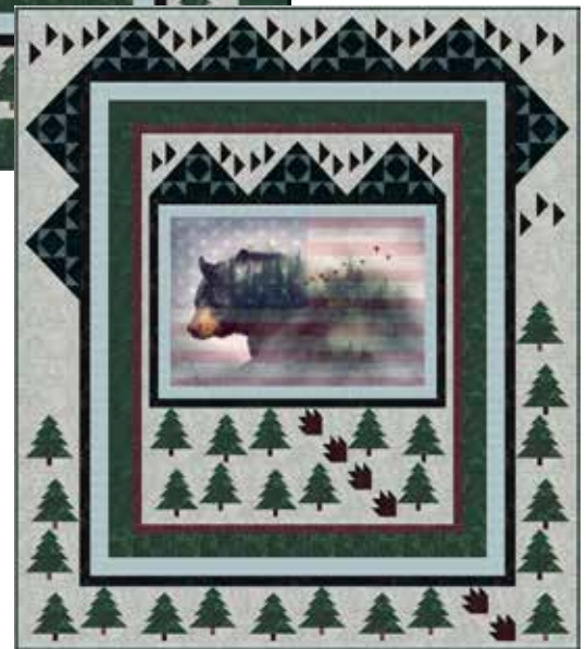
Queen: 93" x 106"