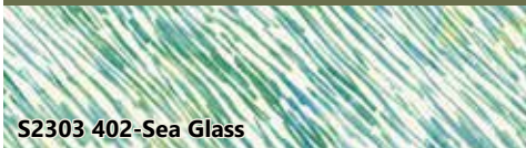
S2303 402-Sea Glass