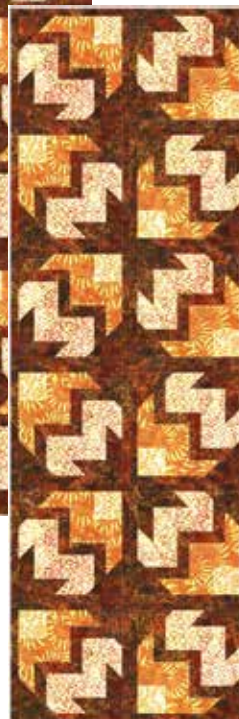
Runner: 15" x 45"