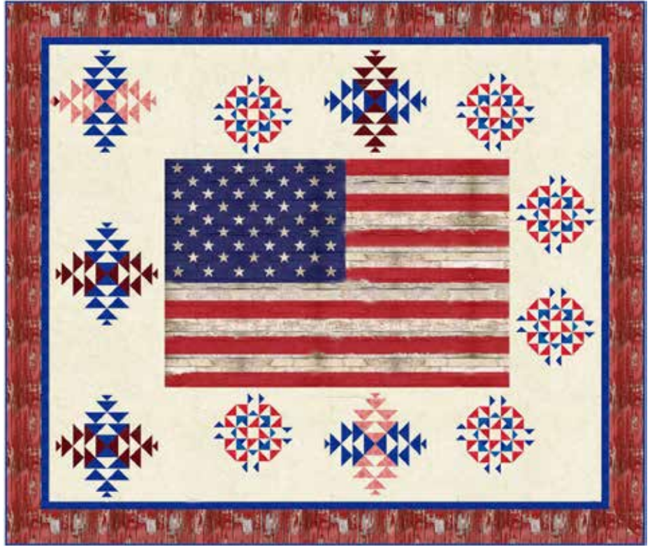
T4889 83-Barn Red