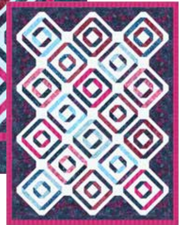
Twin Quilt: 74" x 96" Aquarius Colorway