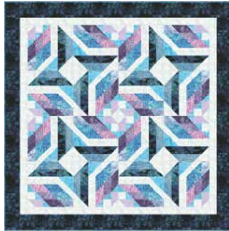
Deep Blue (Throw) Colorway