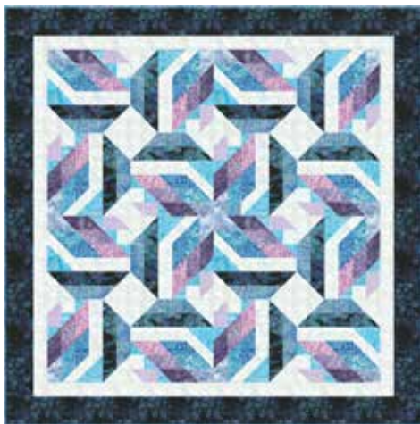
Deep Blue (Throw) Colorway