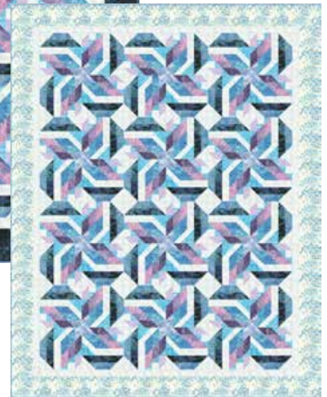
Baby Blue Colorway