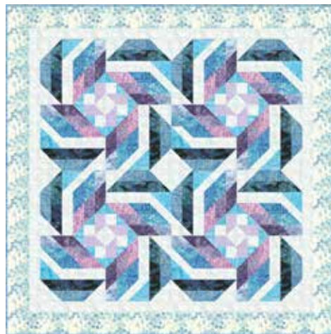
Baby Blue (Throw) Colorway