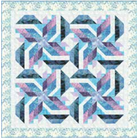
Baby Blue (Throw) Colorway

One simple block! Simply rotate the block for many layout options.