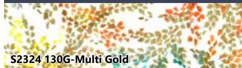
S2324 130G-Multi Gold