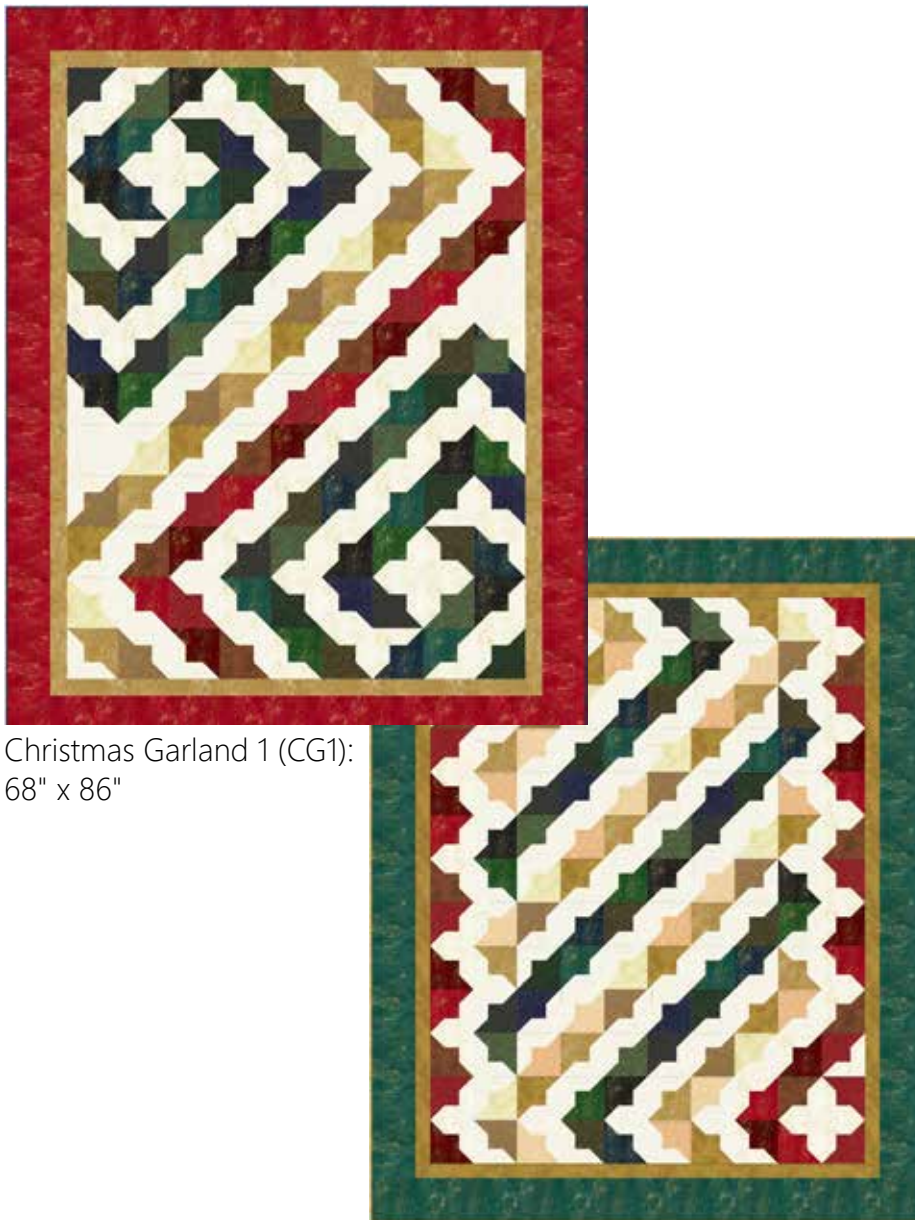
Christmas Garland 1 (CG1): 68" x 86"

Same block, but two fun layouts, all in one pattern! Note slightly different fabric requirements for the two.