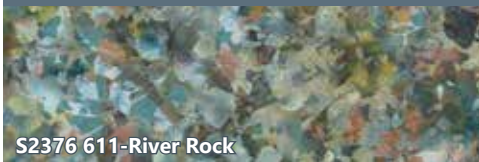
S2376 611-River Rock