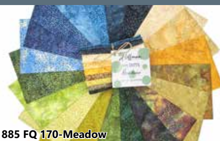
885 FQ 170-Meadow