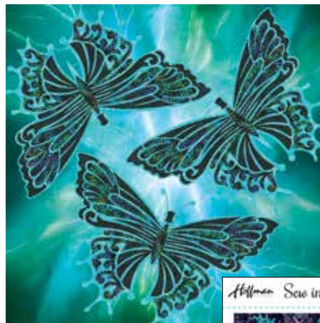
JHBKIT 61-Turquoise on Aqua