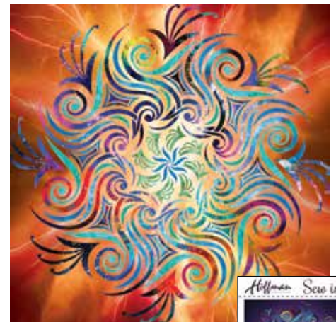
SNS2KIT 635-Fundamentals on Flame