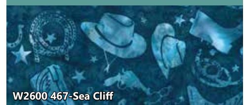
W2600 467-Sea Cliff