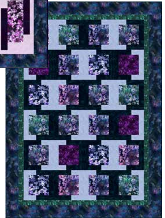
Half and Half (H&H): 62 1/2" x 86 1/2"