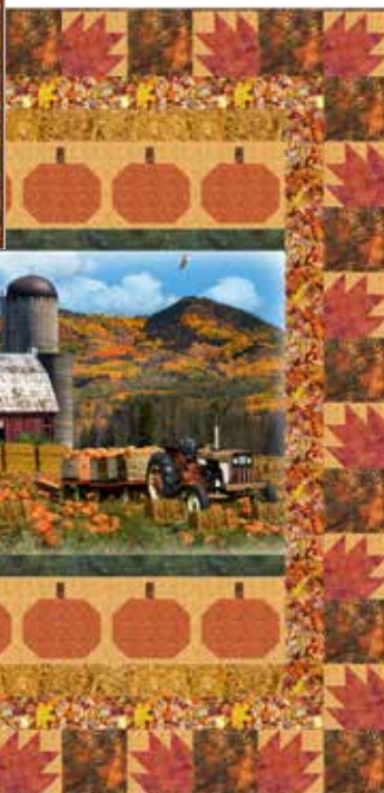
Pumpkin Patch (PP) by Castilleja Cotton: 60" x 72"