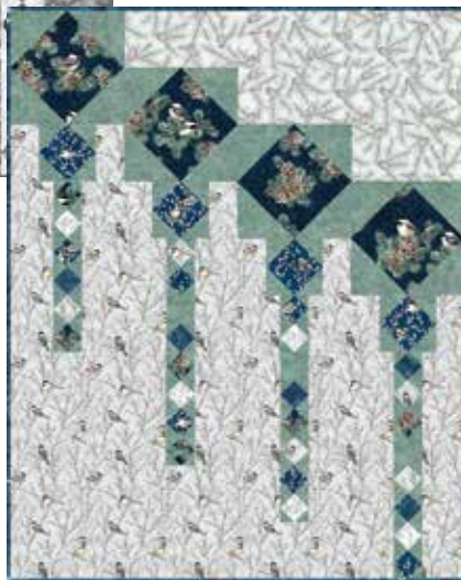
Navy Silver Colorway