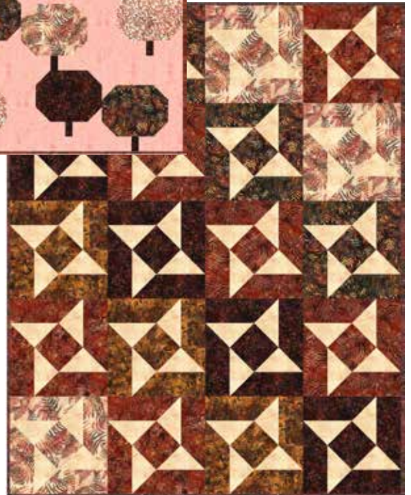
Fall Windmills (FW): 48" x 60"