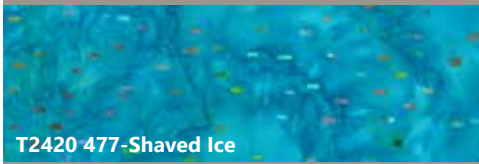
T2420 477-Shaved Ice