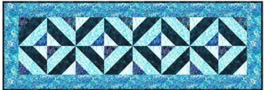
Beachcomber (B): 18" x 54"