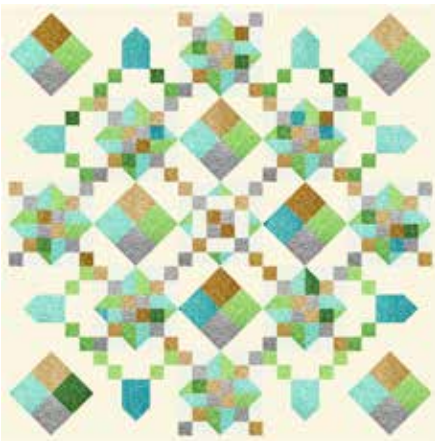
Throw Quilt: 60" x 60"