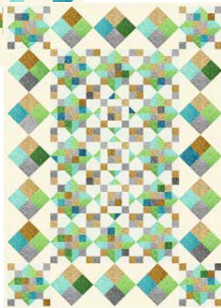
Twin Quilt: 60" x 84"