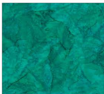
1895 146-Stone Green