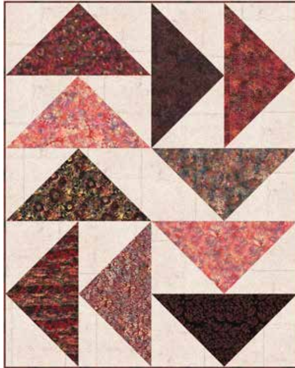
Lazy Goose (LG): 64" x 80"