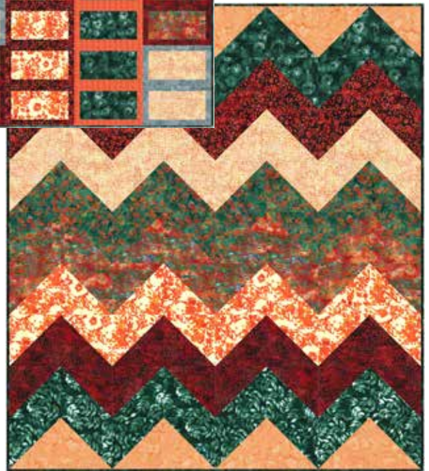
Mountains: 56" x 63"