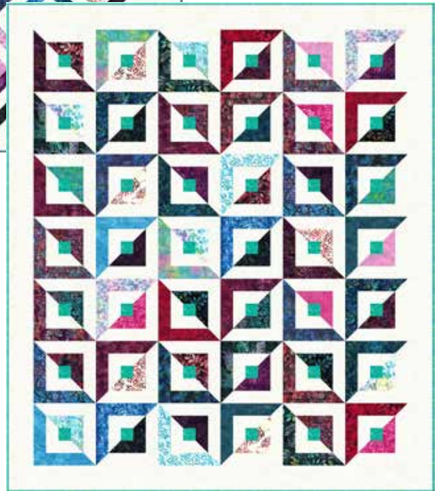
Oberlin Quilt: 68" x 78"