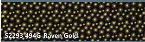
S2293 494G-Raven Gold