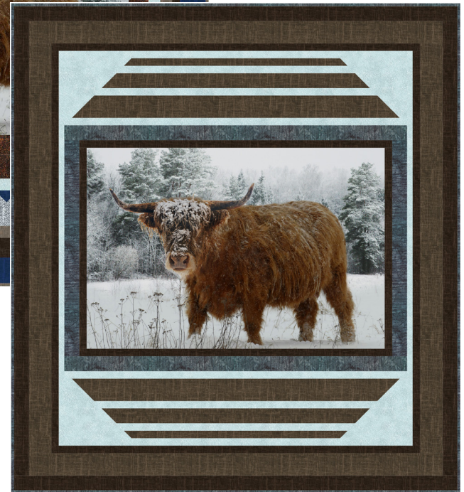
Screen Time: 60" x 65 1/2"