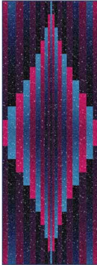
Ombre Diamond Two: 29" x 80"