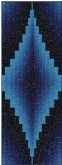
Ombre Diamond Opal (ODO): 29" x 80"