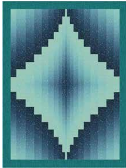
Ombre Jewel Turquoise (OJT): 67" x 88"