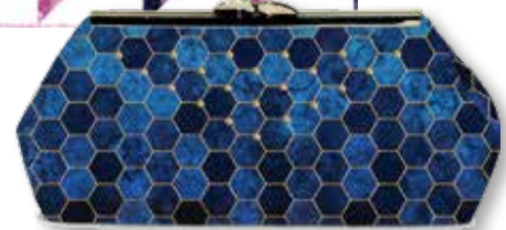
Modern Clutch by Pink Sand Beach Designs