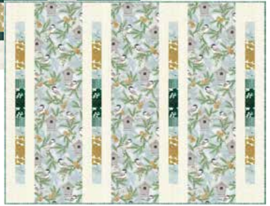
Windchime: 54" x 42"