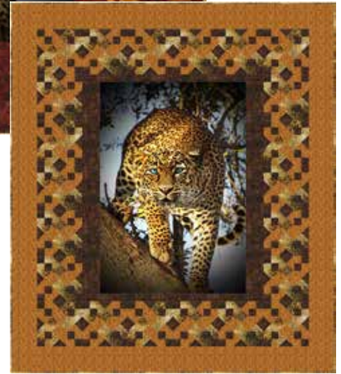
Wishes: 64" x 73"