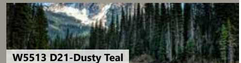
W5513 D21-Dusty Teal