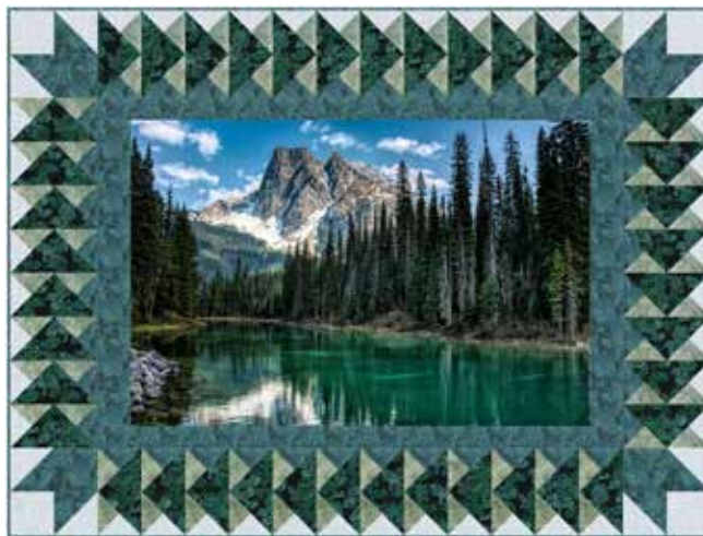
Trek: 64" x 48" by Bear Hug Quiltworks