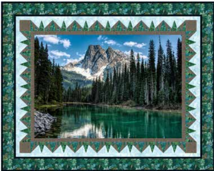
Rising Ridge (RR): 58" x 46" by Tourmaline & Thyme Quilts

A postcard with a stunning view, these quilts are a great escape!